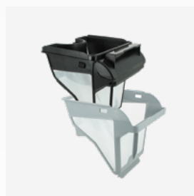
Filter canister Dual stage filter: 150/60 μ