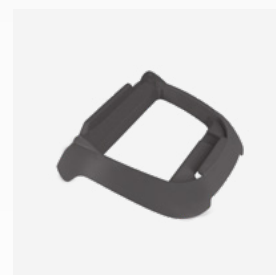
Base for the control unit